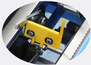
Cutter Blade Protection Cover