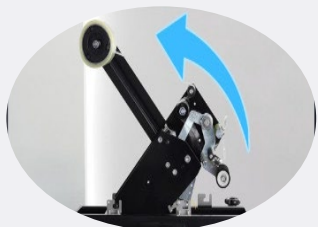
Easy Tape Head Changeout